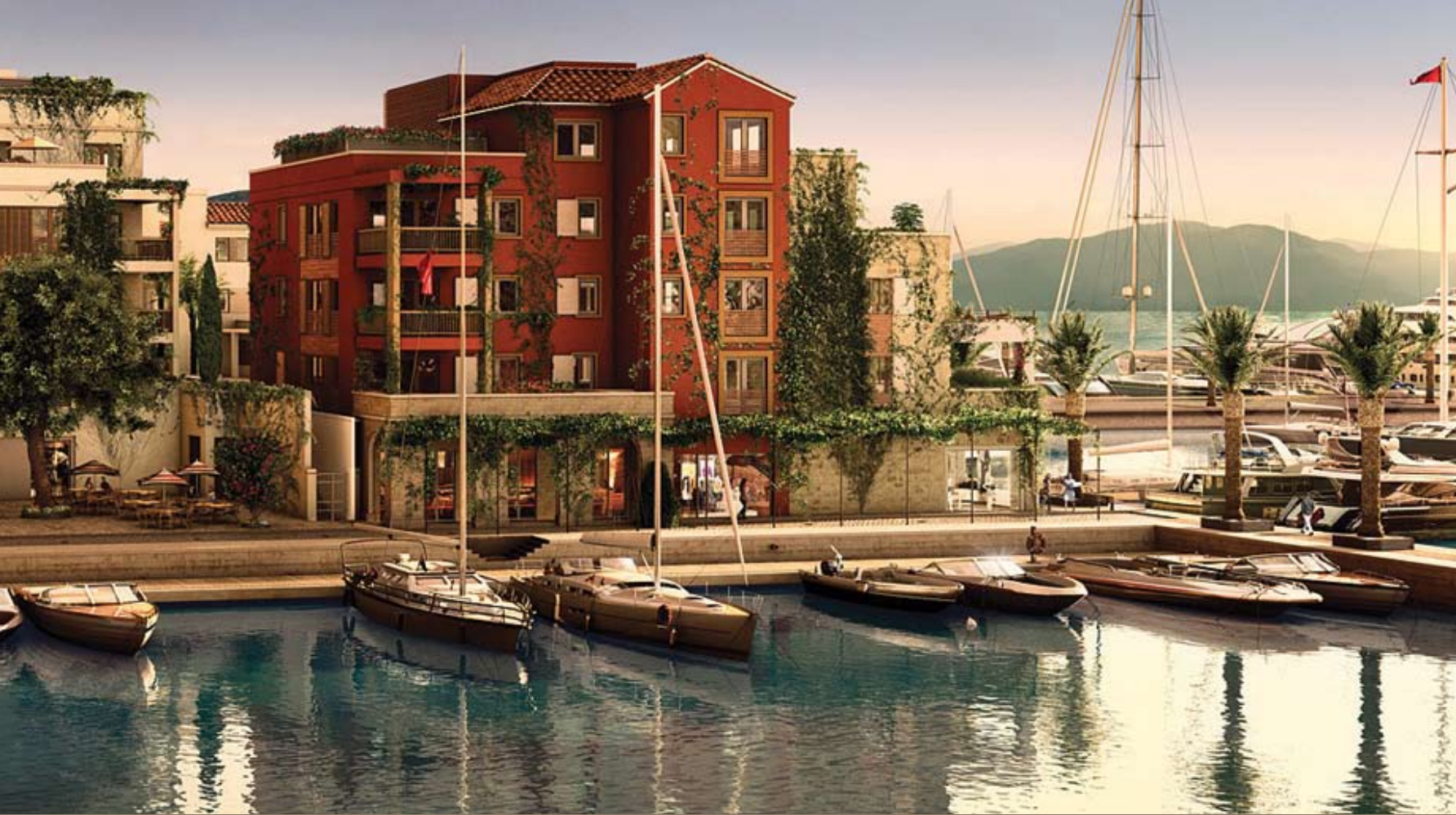
CGI OF THE OZANA RESIDENCES ON VENICE SQUARE (COMPLETION DECEMBER 2010)