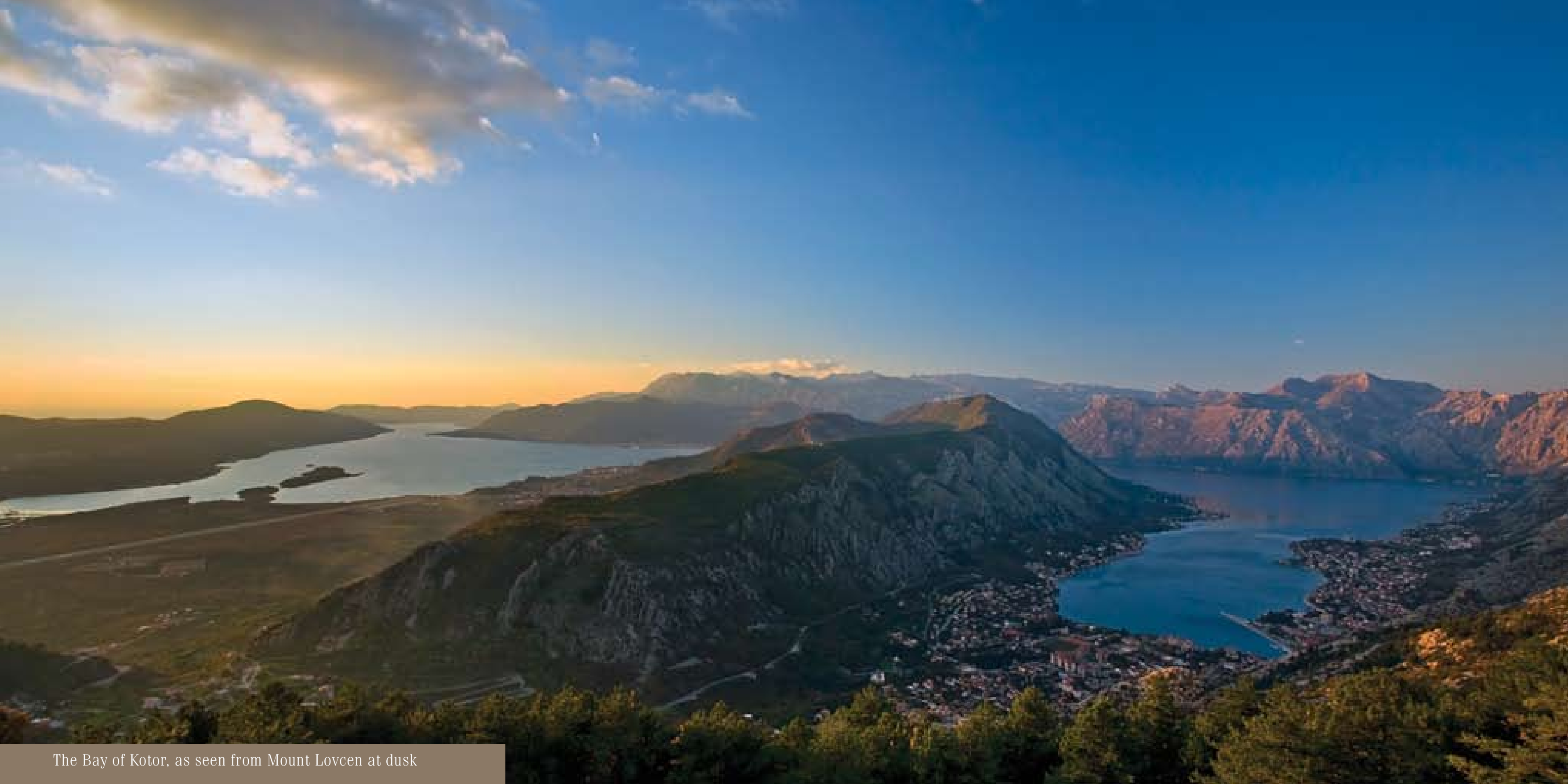
The Bay of Kotor, as seen from Mount Lovcen at dusk