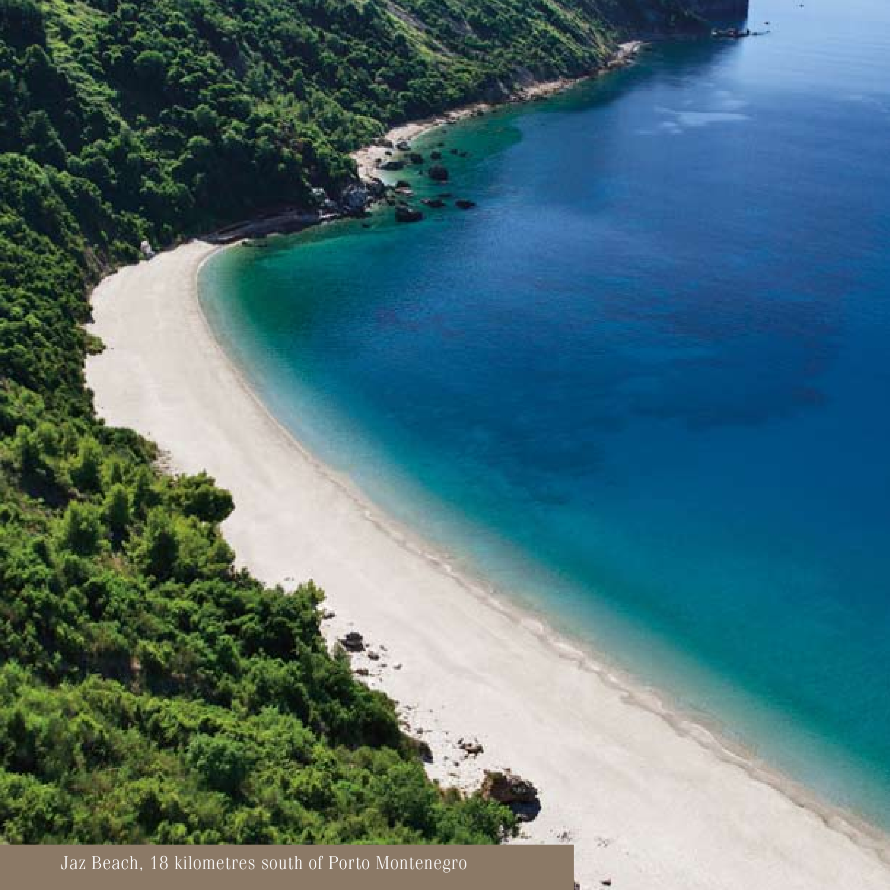
Jaz Beach, 18 kilometres south of Porto Montenegro