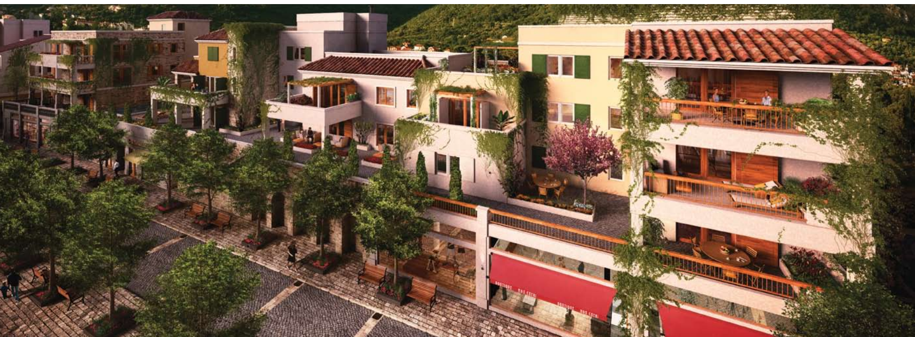
CGI OF THE ZETA RESIDENCES (COMPLETION DECEMBER 2010)