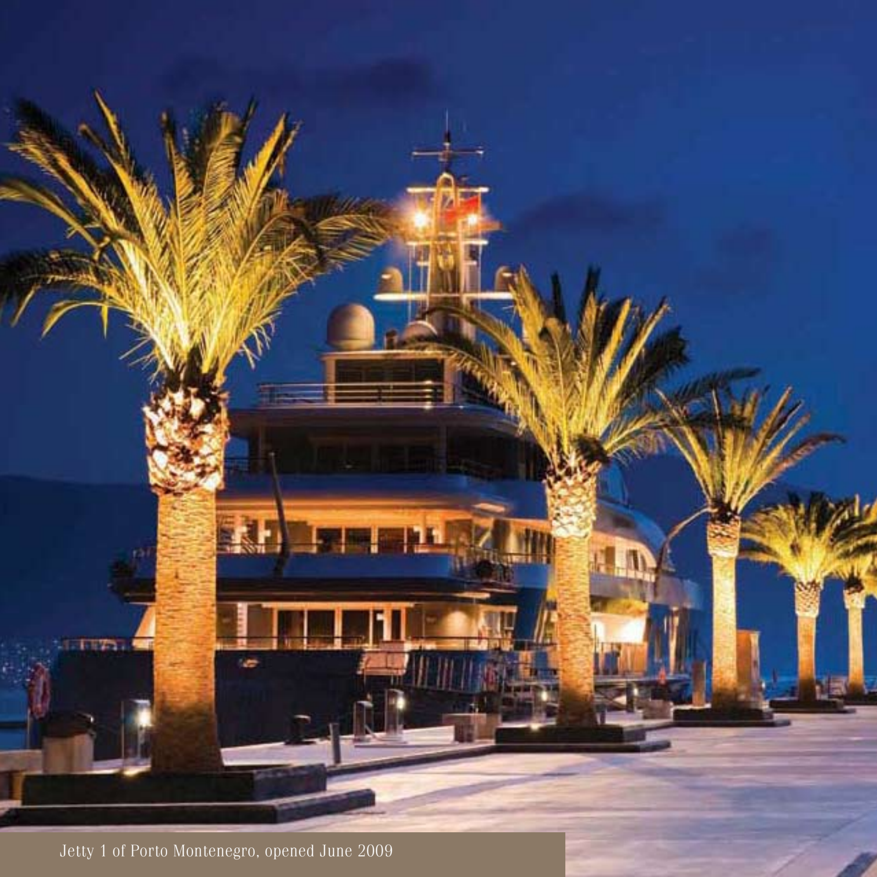
Jetty 1 of Porto Montenegro, opened June 2009