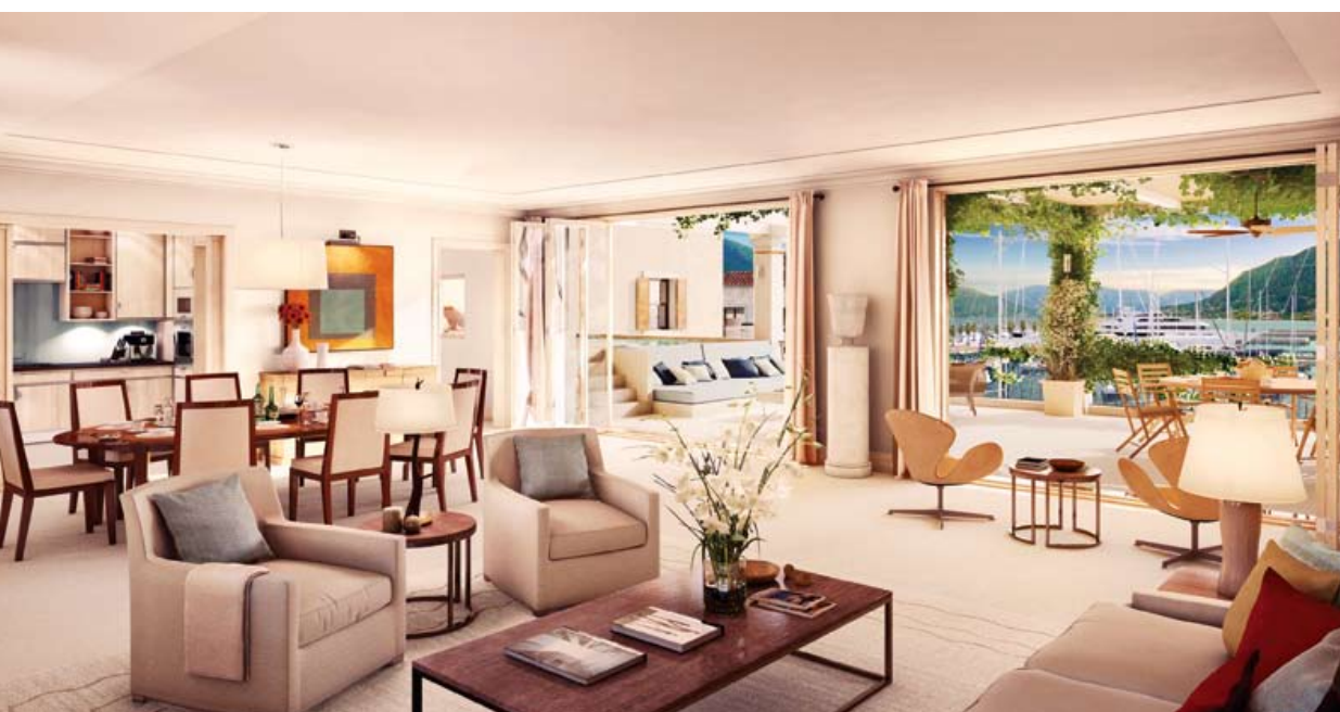
SPACIOUS RESIDENCES FEATURE HIGH CEILINGS AND AN ABUNDANCE OF NATURAL LIGHT (CGI)