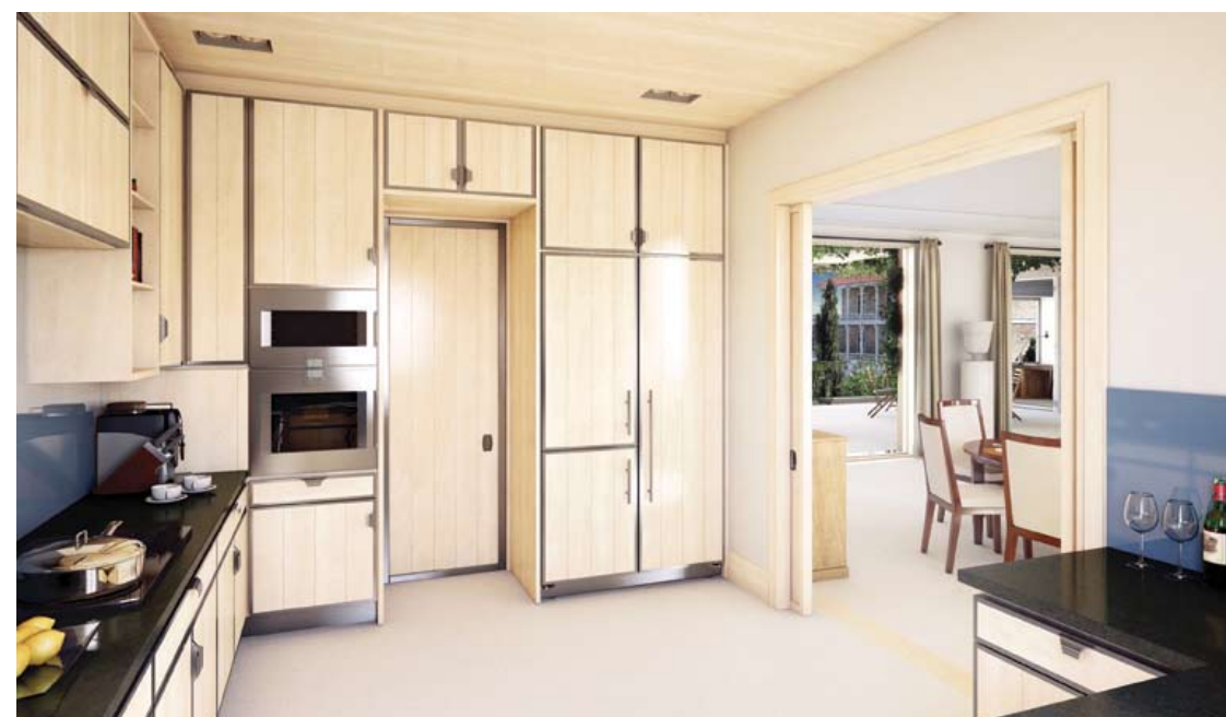
KITCHENS FEATURE HIGH QUALITY APPLIANCES WITH CUSTOM-DESIGNED FITTINGS (CGI)

With nearly a full kilometre of west-facing waterfront, all residences will be adjacent to the marina and offer spectacular views across the Bay of Kotor. An abundance of flowering and deciduous trees will provide shade.