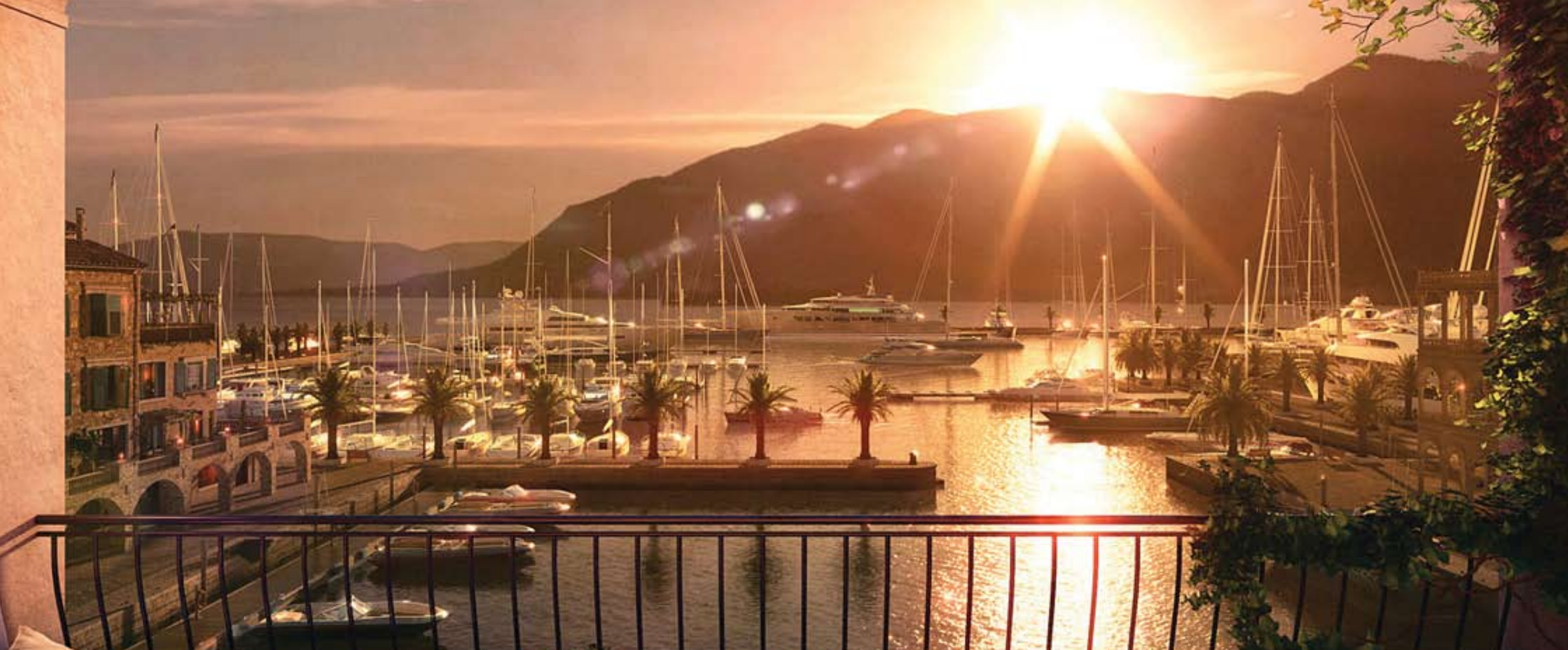
CGI OF A VIEW OF THE MARINA FROM A PORTO MONTENEGRO RESIDENCE

Porto Montenegro is planned as a year-round community, allowing owners and captains the opportunity to own a home just a few steps from their boats